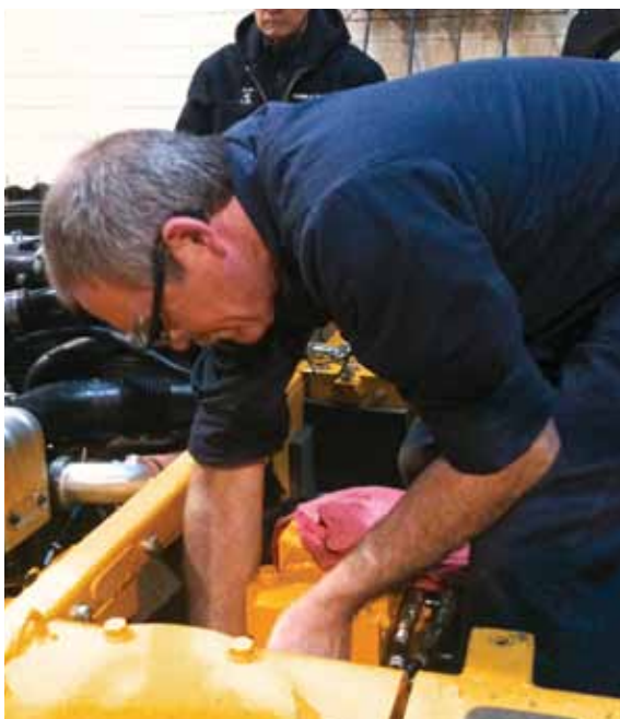
A KATC judge from Komatsu checks over the repairs made to a PC200LC-8 by a contestant technician. The annual contest challenges Komatsu technicians from across the nation, testing their skills in troubleshooting, maintenance and repairs.